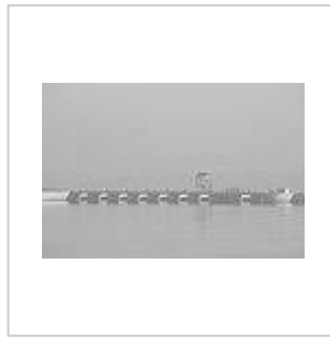
Zeugma The dam nearby