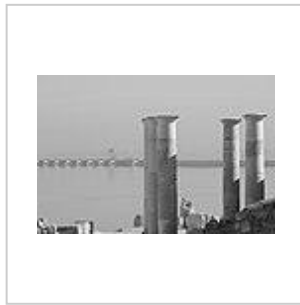
Zeugma Excavations and dam