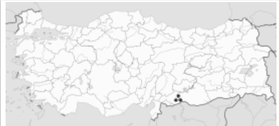
Shown within Turkey