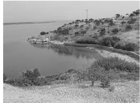
Parts of Zeugma have become submerged in the Euphrates River since the construction of the Birecik Dam