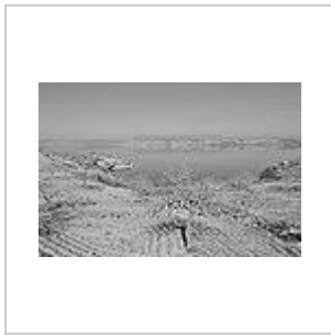
Zeugma The lake